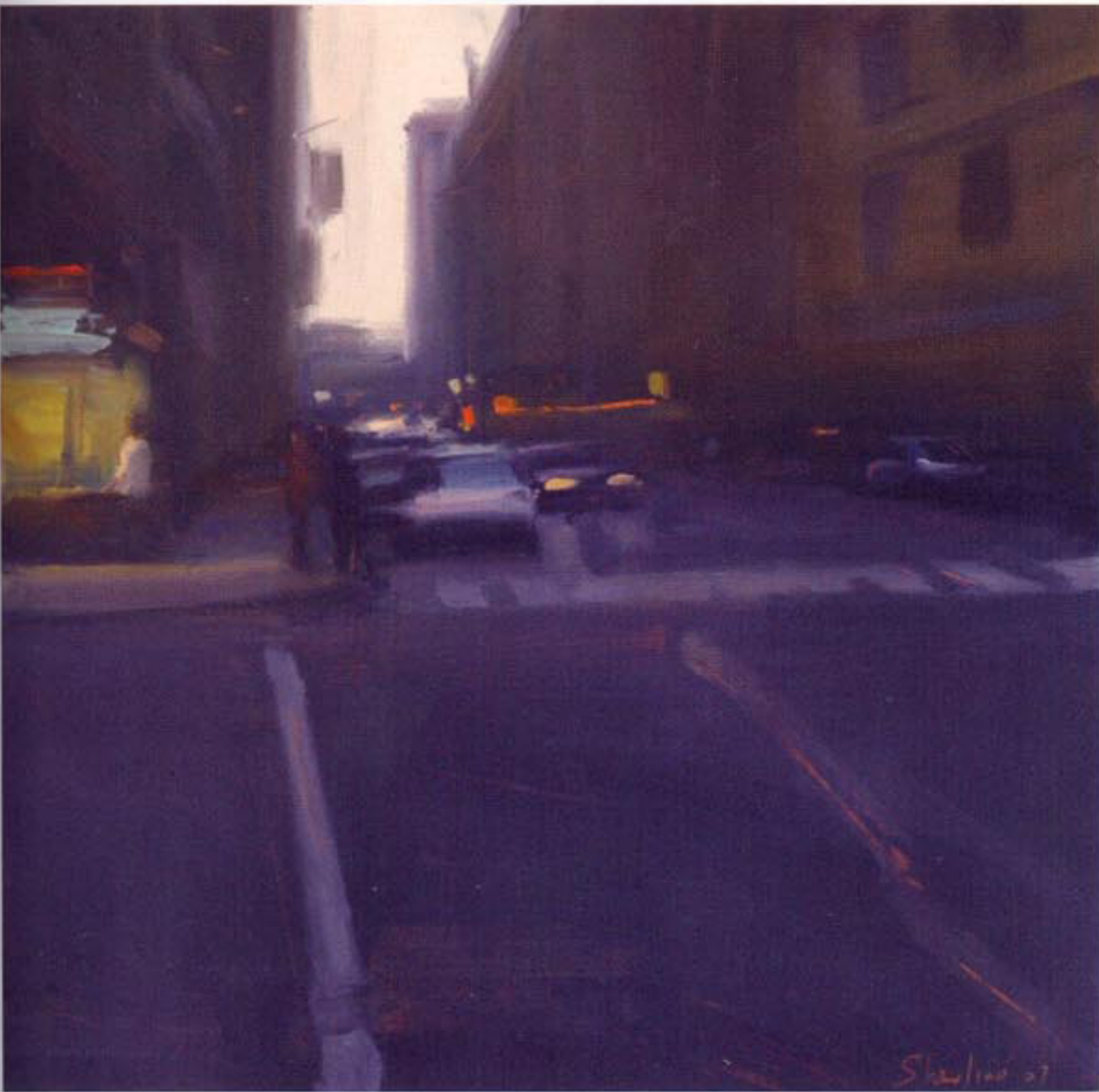
FIGURES AT A CORNER, OIL ON PANEL, 18 X 18"

looking for," says Shevlino. "If things need to be tweaked, moved, edited I'm ok with that because the end goal is always the composition and then I just go from there and start using the paint to get what I want."