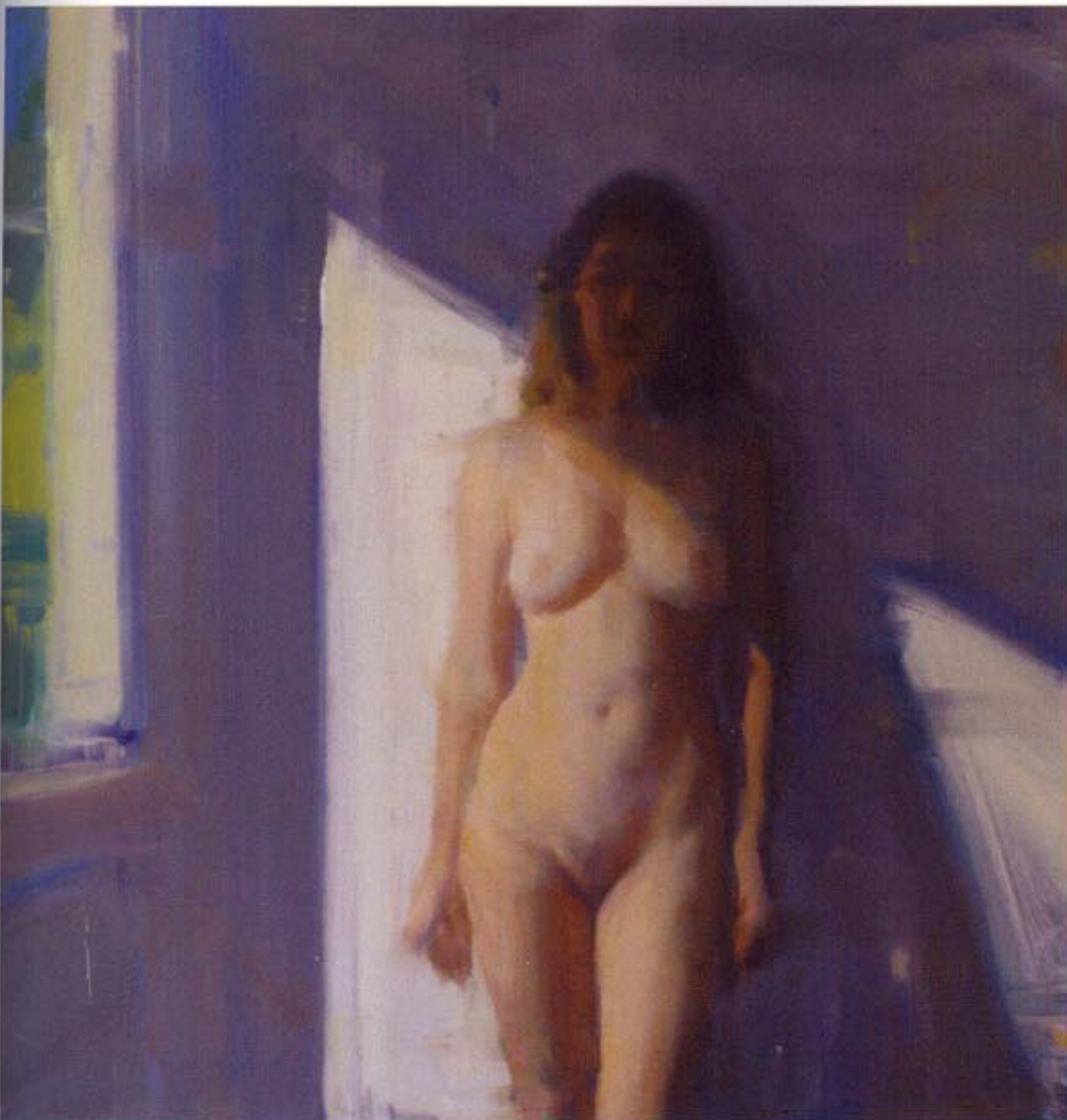
FIGURE BY A WINDOW, OIL ON CANVAS, 43½ X 42"