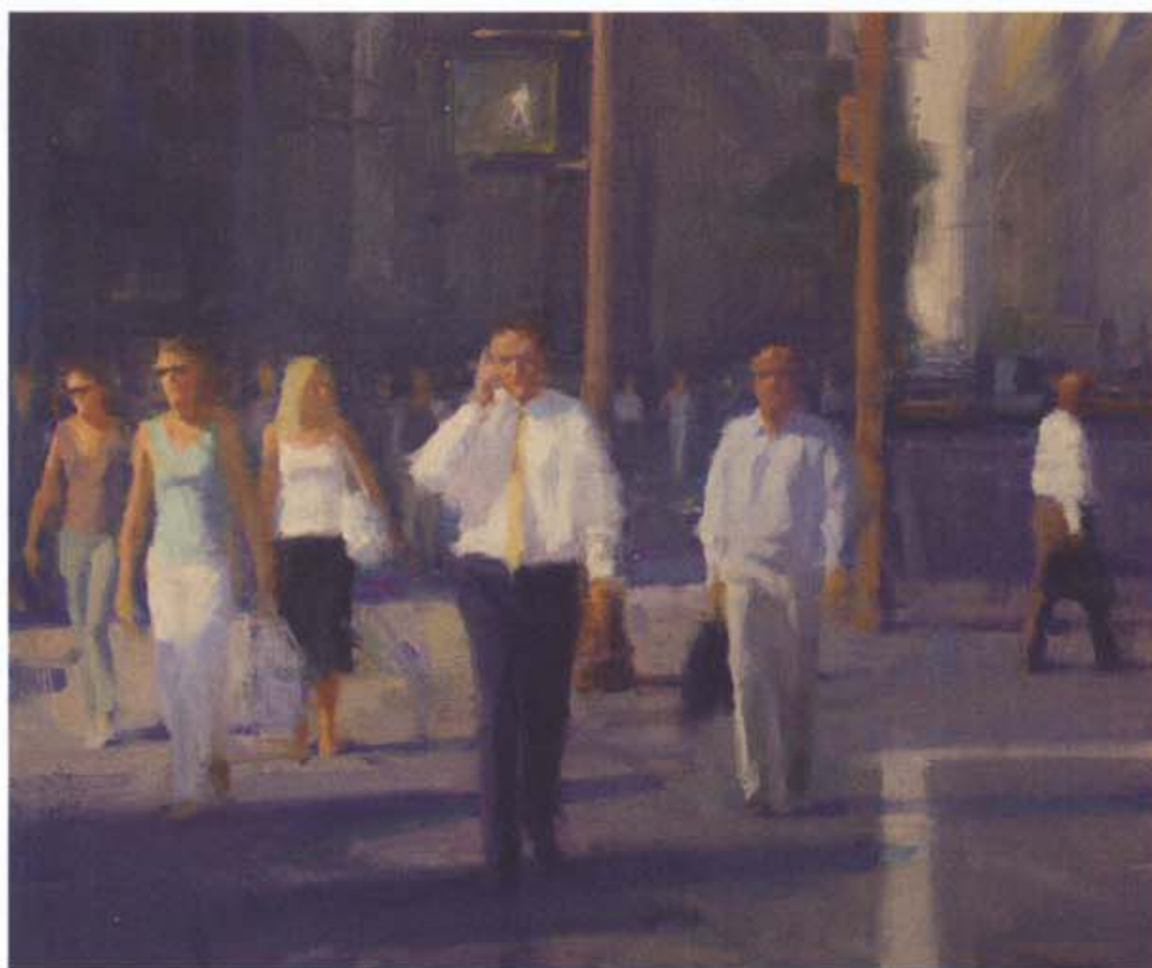
MIDTOWN, OIL ON CANVAS, 50 X 59"

"I drive around the city late in the day, which is my favorite time because it has that sort of particular light that I'm